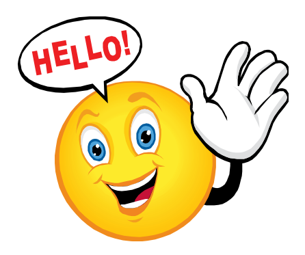
Saluda tu vecino

Use these visuals to teach children the lyrics to the song. Practice following these directions before playing the song until the children learn the sequence. Play the song and use each visual as a cue to guide the children in following the directions. Bonus directions are at the bottom for an extended activity.