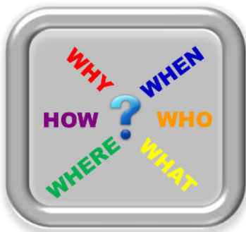
Language Intervention Strategies