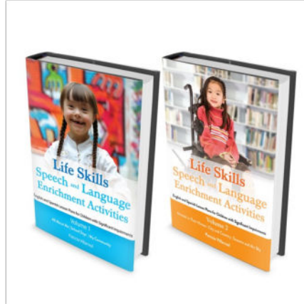
Life Skills Speech and Language Enrichment Activities