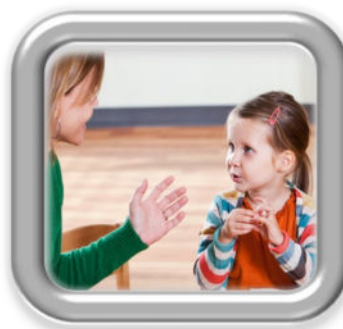
Success with Speech Sound Disorders