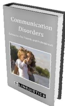
Communication Disorder Resources for Parents and Professionals E-book