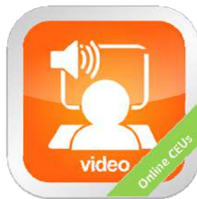
Effectively Evaluating Young Children