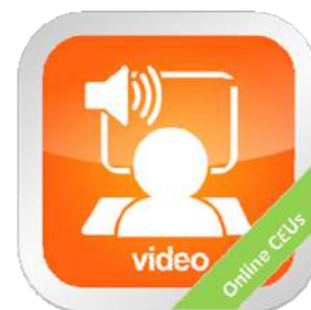
Effective Educational Strategies That Take Poverty into Consideration