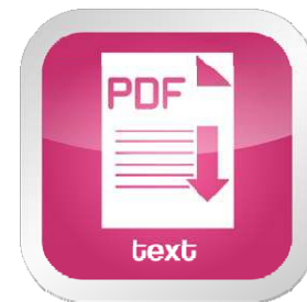
Bilingual Literacy-based Intervention