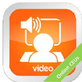
Increasing Parent and Teacher Involvement