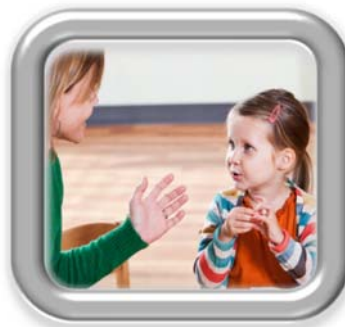
Success with Speech Sound Disorders