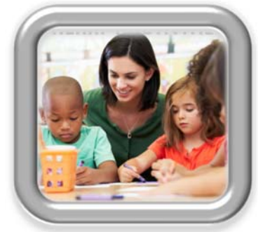
Literacy-based Intervention Step-by-Step