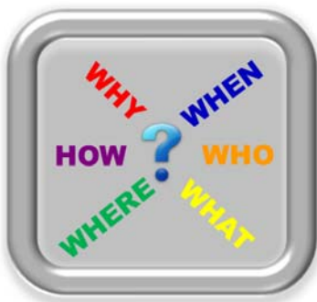
Language Intervention Strategies for Monolingual and Bilingual Children