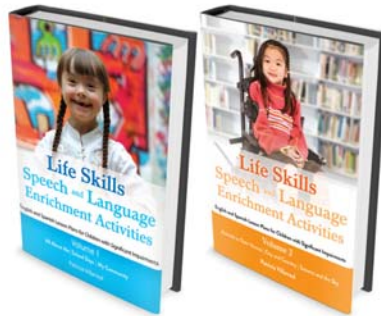
Life Skills Speech and Language Enrichment Activities