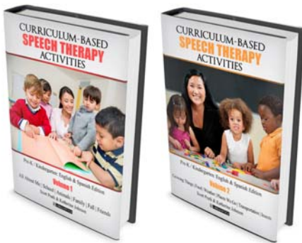
Curriculum-based Speech Therapy Activities: Pre-K / Kindergarten

Great resources to therapy! Click below: