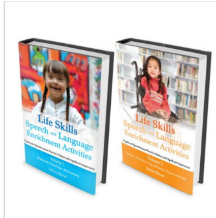
Life Skills Speech and Language Enrichment Activities