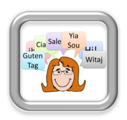
Difference or Disorder? Language Course