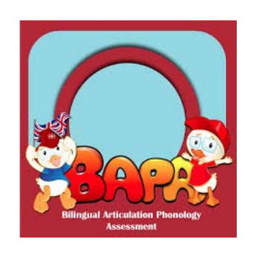
Bilingual Articulation and Phonology Assessment (BAPA)