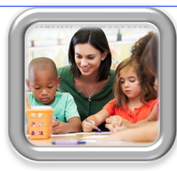
Literacy-based Intervention Step-by-Step