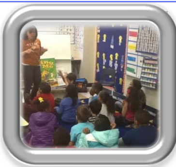
Breaking Into the Classroom: Service Delivery in the Schools