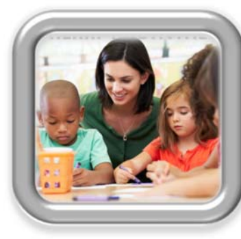
Literacy-based Intervention Step-by-Step