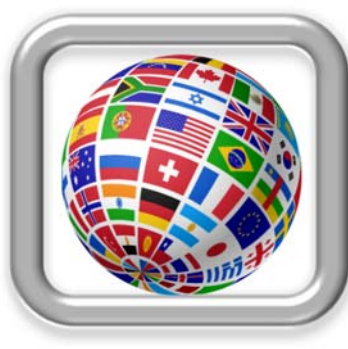
Working with Interpreters