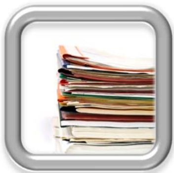
Collaborating with Educational Diagnosticians in the Referral and Evaluation Process