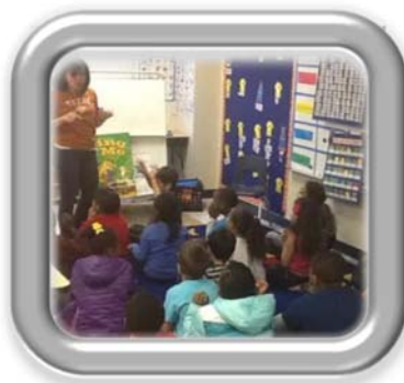
Breaking Into the Classroom: Service Delivery in the Schools