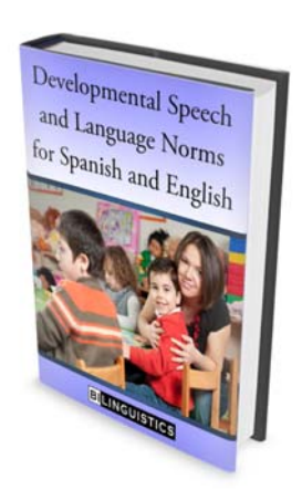
Developmental Speech and Language Norms for Spanish and English E-book