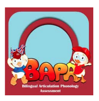
Bilingual Articulation and Phonology Assessment (BAPA)