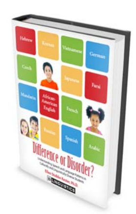
Difference or Disorder? Understanding Speech and Language Patterns in Culturally and Linguistically Diverse Students