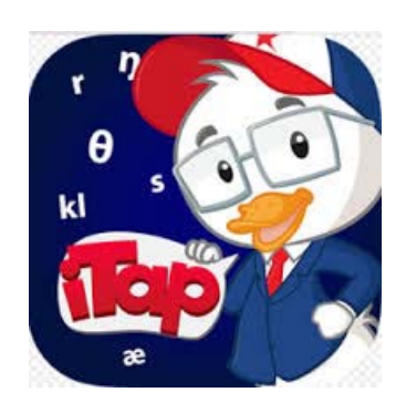
Test of Articulation and Phonology (iTap)