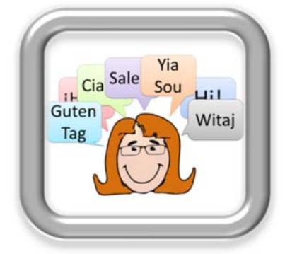
Difference or Disorder? Language Course