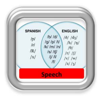
Difference or Disorder? Speech Course