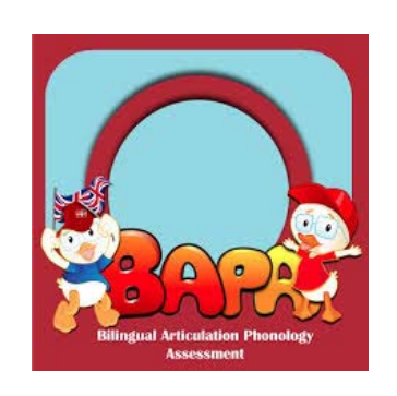
Bilingual Articulation and Phonology Assessment (BAPA)