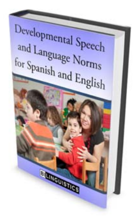
Developmental Speech and Language Norms for Spanish and English E-book