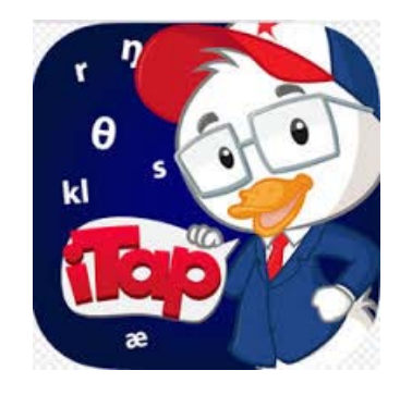
Test of Articulation and Phonology (iTap)