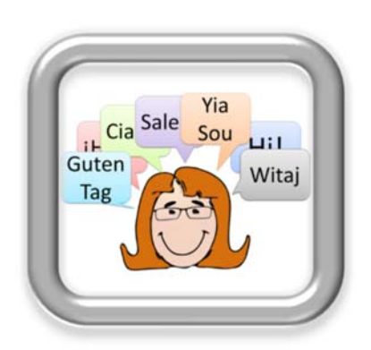
Difference or Disorder? Language Course