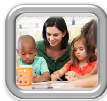
Literacy-based Intervention Step-by-Step