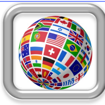
Working with Interpreters